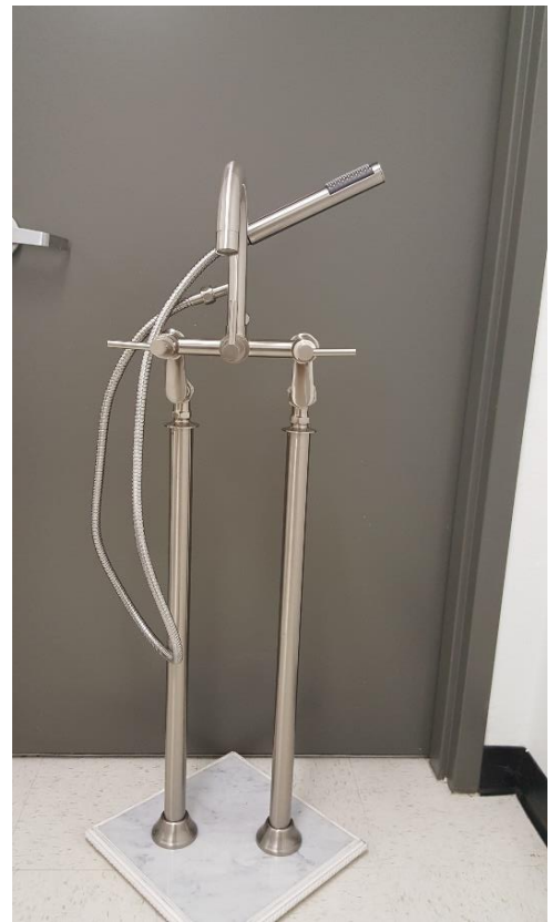
Center adjusters can be added to correct rough opens rough from 4 " to 9 "