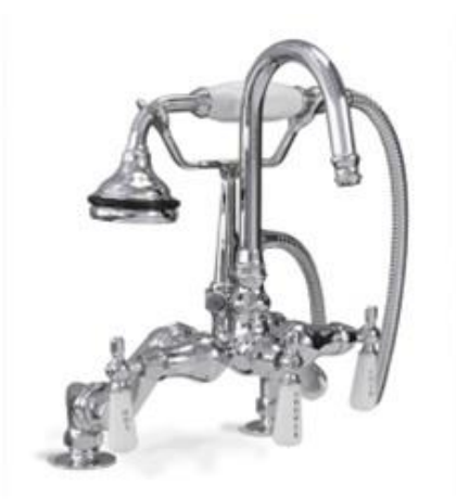
Edwardian Faucet with 2 " riser elbow ICS always uses center adjusters to open the 3 3/8" Edwardian faucet to a 7 inch spread for rough in.