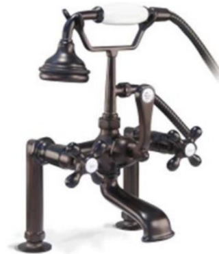
Victorian Faucet with 6 " riser elbow 2 " riser elbow is standard, use 6 " when extra height is needed on all faucets.

4 " extensions are available to extend faucet farther into the tub. Moves snout into tub farther. 2 " riser elbows are standard; 6 Inch riser elbows available. Center adjuster (swing arms ) are used to correct a rough spread or to add to faucet height.