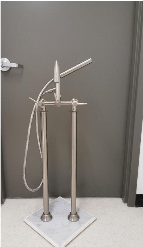
Modern expressions faucet on stands with standard 2 " riser elbow.